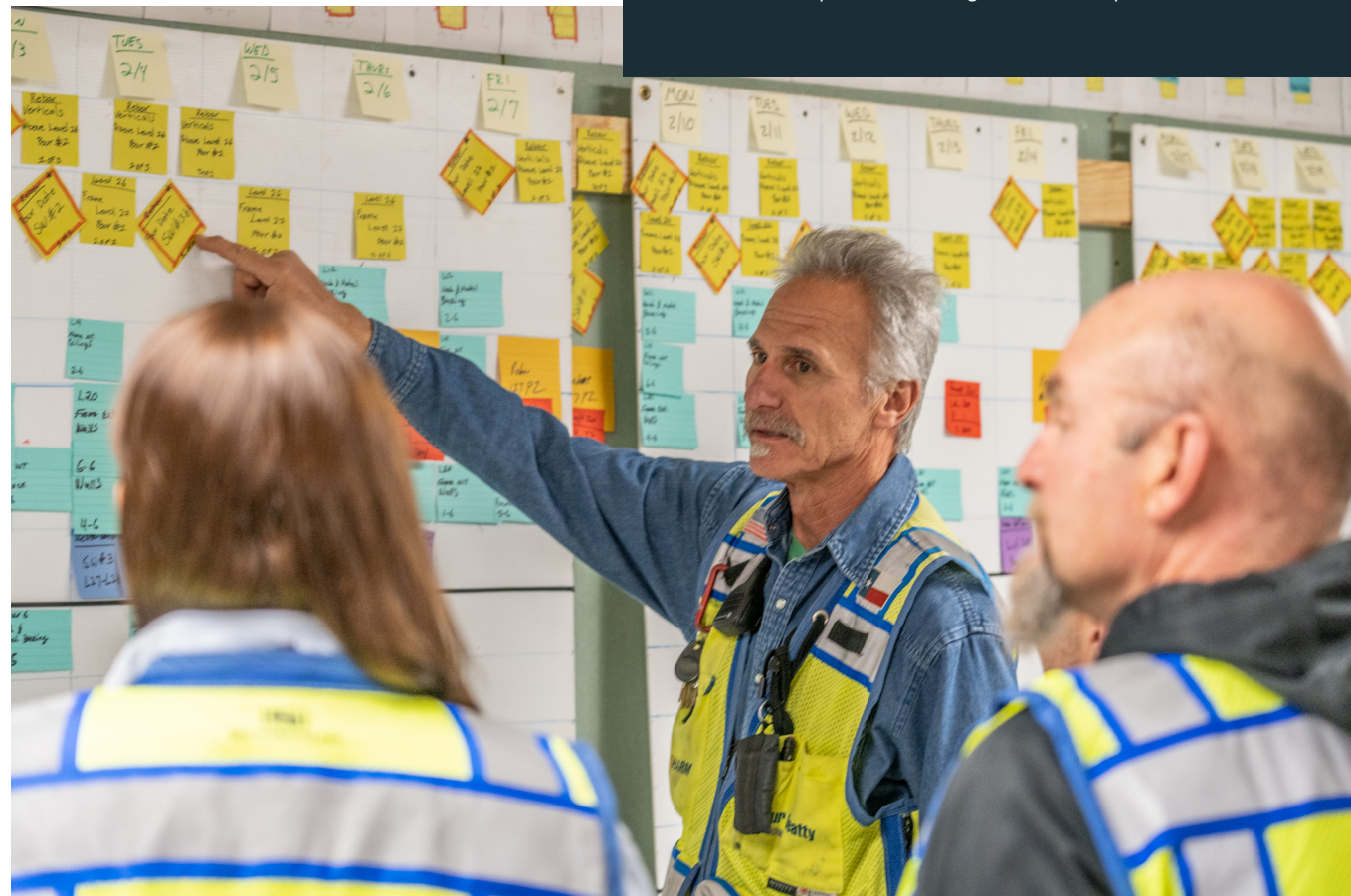
The Atelier Residential Tower, Dallas