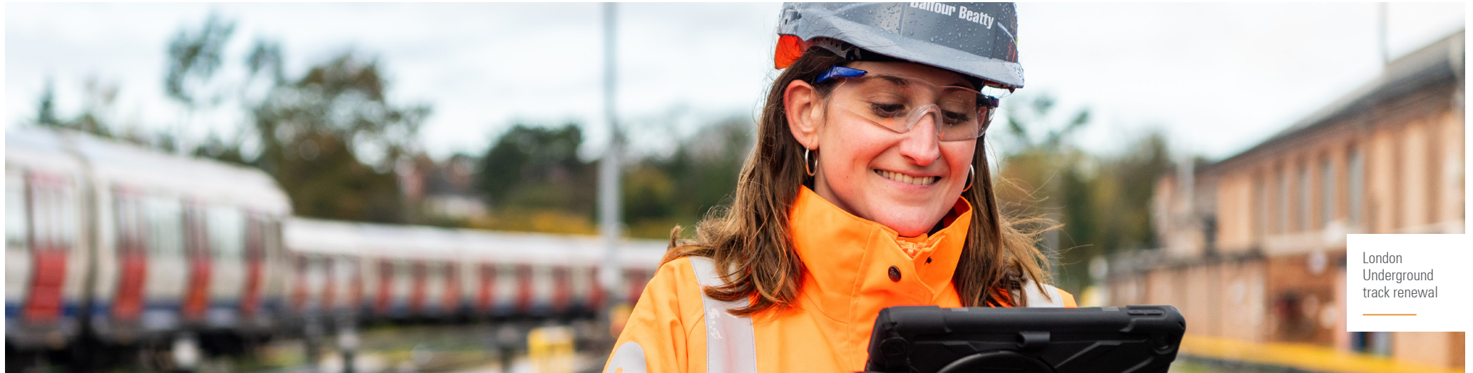
London Underground track renewal