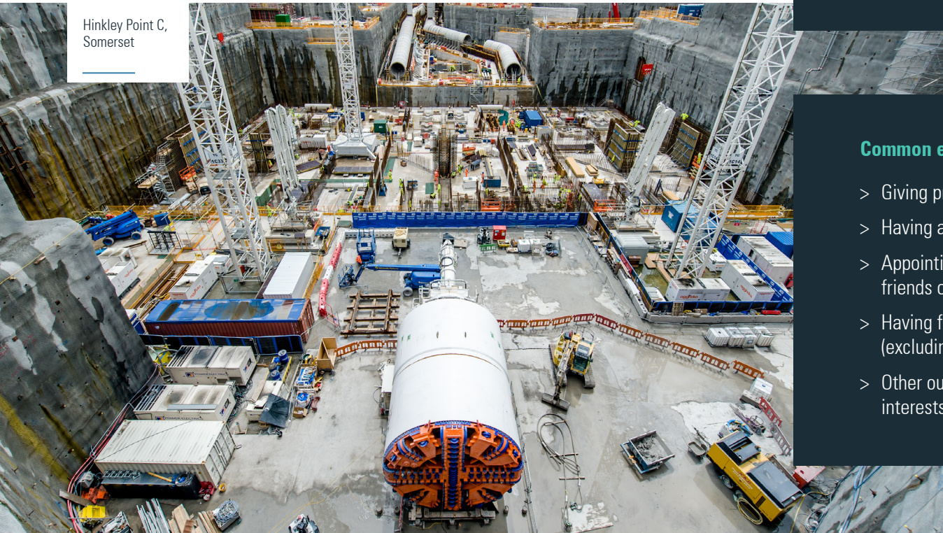
Hinkley Point C, Somerset